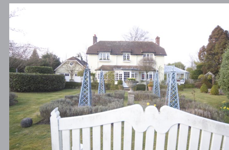
Above: Agents photograph.

The picture to the left was created for the window display, taken with long shadows to give a rustic, woodland feel. The image has been extensively edited to improve colour and reduce the impact of the shadows in strategic areas of the photograph.