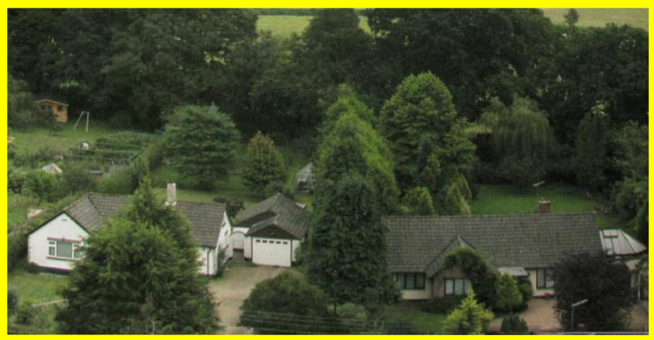
2 Properties in direct line of sight of proposal. 140(degrees) from north and again at 160(degrees) from north.

To assess the impact of new builds on the surrounding environment we can erect masts to the apex roof height of the proposed structure. We can then go to various locations within the area, including local buildings that may be in the line of sight of the structure. These photographs can be used in the planning application to visually show the impact on the area, its skyline and local buildings. Images can be taken and outsourced to a specialist 3D company who can render in a copy of the building for an even more comprehensive evaluation.