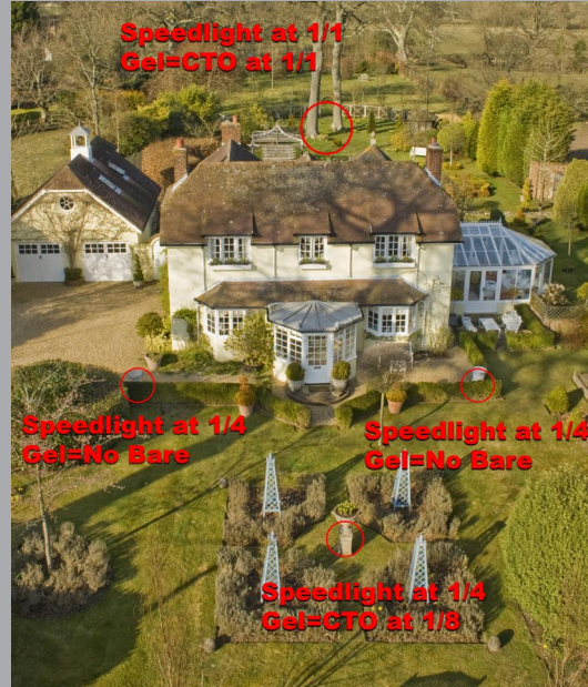
Above: Lighting Diagram for the Brochure Photograph

For more examples of our residential work please feel free to visit our website at: www.icanseetheworld.co.uk